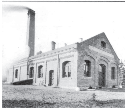
3940 Quadra Street. Photo by Maynard ca. 1900 (BCARS HP65405)

3940 Quadra Street was originally known as the Lake Hill or North Dairy Pumping Station for Victoria's Elk Lake water system. In 1927 it became a jam and canning factory. The company was provided with produce by the Saanich Fruit Grower's Association. In 1954 the building was purchased by Growers Wine Company for use as a cooper's shop and warehouse. The winery was constructed at 3950 Quadra Street in 1927. The buildings now accommodate Industrial Plastics, Fridays and Quadra 24 Hour Sports Club. The Keg Restaurant has operated at 3940 Quadra since 1978.